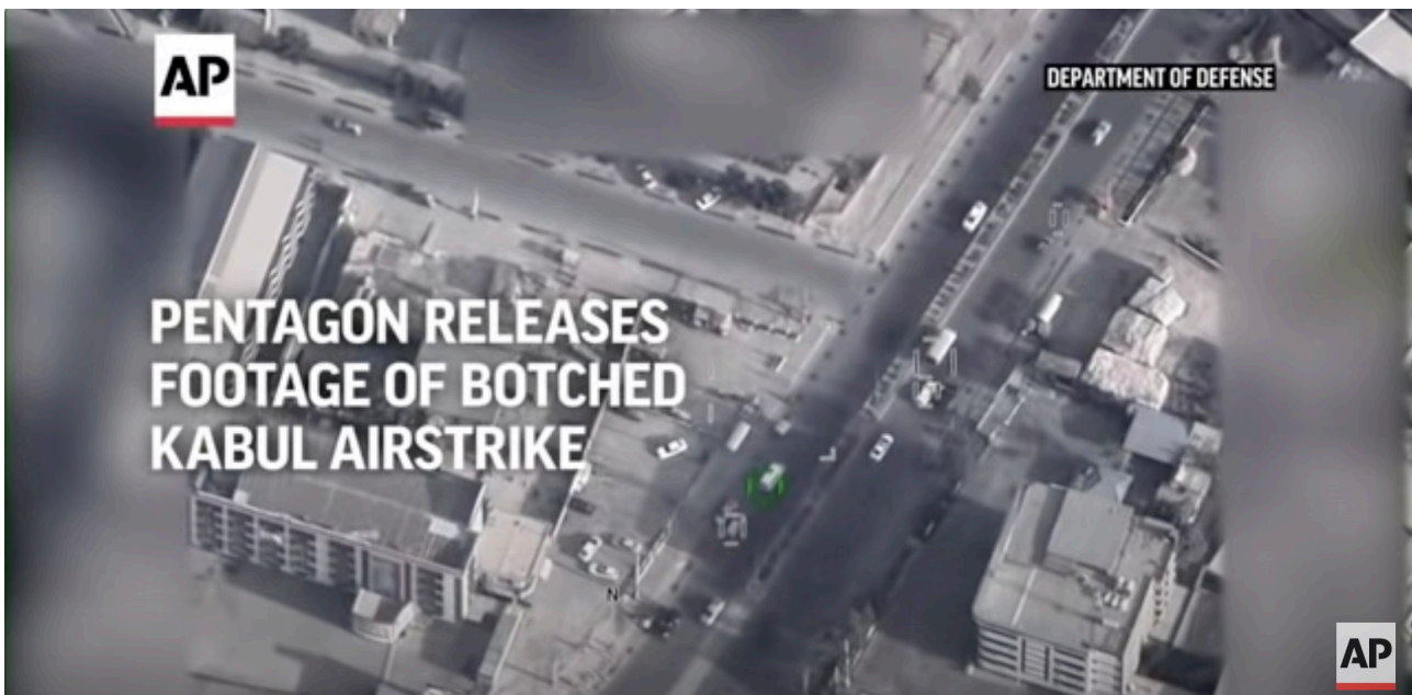
Still from U.S. surveillance drone footage, following a man who was mistakenly identified as an ISK bomber in the Afghan capital Kabul on 29th of August 2021 (source: https://www.youtube.com/watch?v=OBrIsqUk48A )

Even if one would deem the mentioned drone strike an unsuitable example, there have been other instances in which U.S. officials had more than enough time to come to an accurate conclusion but still made factually wrong statements on ISKP and reiterated them . For example, during years when U.S. forces and intelligence had been deployed in various locations in Afghanistan, U.S. officials repeatedly asserted that ISKP is a foreign phenomenon mostly consisting of non-Afghan