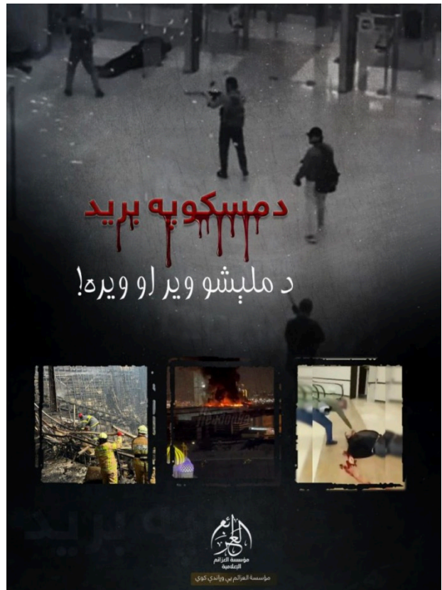
Cover of Al-Azaim pamphlet « Attack in Moscow »

example, various assertions that ISKP took responsibility for the massacre in Crocus City Hall display a pamphlet titled « Attack in Moscow » that was published by the ISKP-affiliated propaganda outlet Al-Azaim shortly after the incident as a claim. While the title of this pamphlet might suggest a claim, actually reading the 30 pages long document in Pashto reveals that the pamphlet does not only never indicate an ISKP authorship of the attack but lacks any detail that a group involved in the assault would have had and likely mentioned. In fact, the text most of the time does not make any reference to the massacre near Moscow, already starting out with and then practically fully consisting of a rather incoherent rant against the Afghan Taliban whom ISKP accuses of collaborating with Russia as well as other nations and whom ISKP has always actively opposed. 2