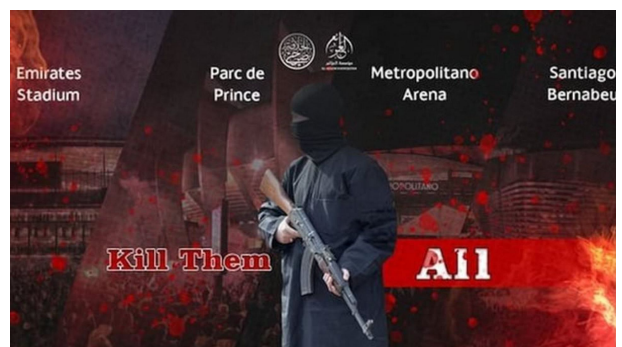
Poster threatening attacks on European football stadiums, published — but not created — by ISK-affiliated Al-Azaim outlet (early April 2024)

This, together with examples such as Al-Azaim republishing posters implying threats against football stadiums in Europe that were created by pro-IS accounts of unknown origin, but not ISKP, further underlines the already mentioned likelihood that ISKP propaganda publishes whatever grabs attention and not what the group is actually prioritising.