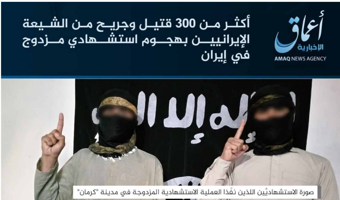
Photo of IS members who conducted bombings in the Iranian city of Kerman on 3 rd of January 2024

The assessment of numerous other frequently cited cases of government statements claiming ISKP links to suspects then proves difficult, as the lack of specific details often makes it impossible to corroborate their veracity. That said, the scarce publicly available information in such cases regularly implies that ISKP links were, at the very least in some cases, made based on questionable assumptions. For example, one often gets the impression that qualifying an IS suspect as belonging to ISKP might have been mainly done based on Central Asian origin. While there are many reasons why this is more than questionable, it is even purely statistically speaking more likely to be wrong than right. Although there are no exact figures, the clear majority of all the citizens of Tajikistan and Uzbekistan who, at some point became members of IS, joined IS in Syria and Iraq, not ISKP. 8 There is also a seeming tendency to see any Turkish connexion or use of Cyrillic script as a sign for an